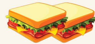
Ham, Cheese & Tomato Sandwiches with French Fries 35