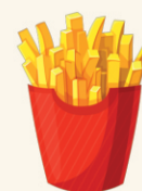
Hand-Cut French Fries 25