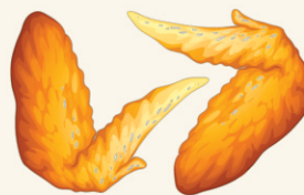
BBQ Chicken Wings 30