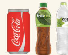
Regular Drink 15