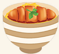
Chicken Katsu Bowl 35