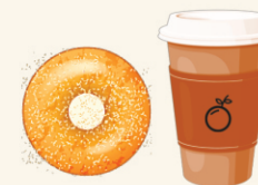
1 Cinnamon Hot Donut + Black Coffee 20