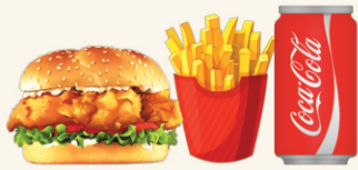
Tippo's Chickie Box 45 Breaded chicken breast, lettuce, tomato, chili mayo, served with French fries, and Soft Drink/ Ice Tea/ Water