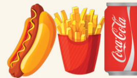
Hot Dog 45 Grilled sausage, mustard & sauce, served with French fries, and Soft Drink/ Ice Tea/ Water